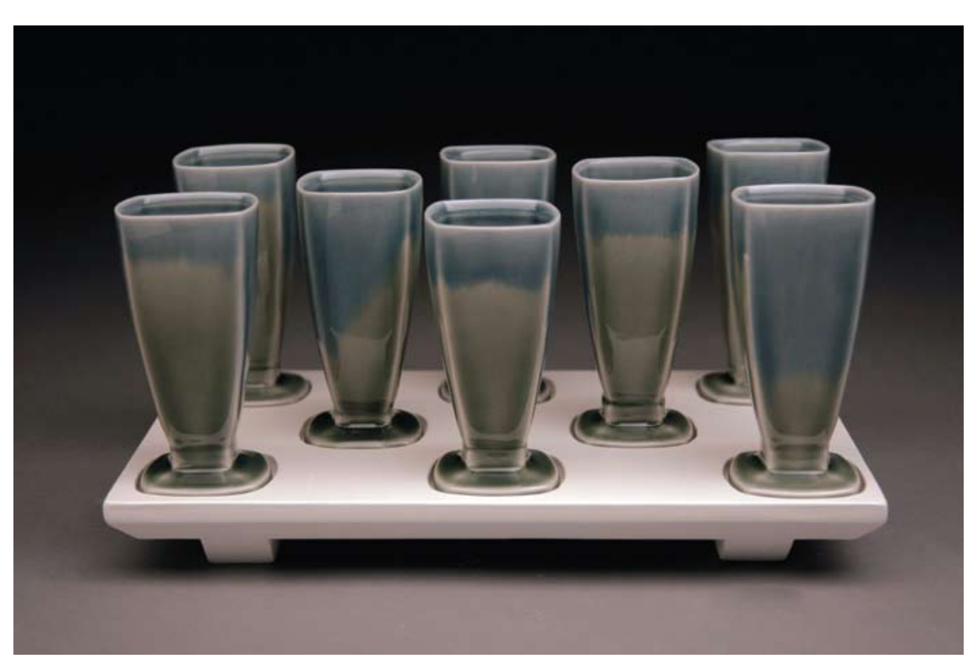
Toasting Cups, 10 in. (25 cm) in length, porcelain with glaze, fired to cone 10 in oxidation.