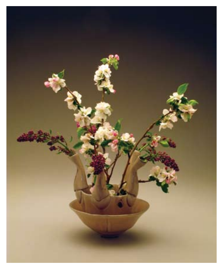
Flower vase with bowl, 9 in. (23 cm) in height, mid-range redware, fired in oxidation.

My functional pots are forms that convey the significance of what I call "domestic intimacy," a recognition of the impact that domestic actions have on our identities and the quality of our lives. This flower vase with bowl is a piece that celebrates the power of beauty in the domestic environment.