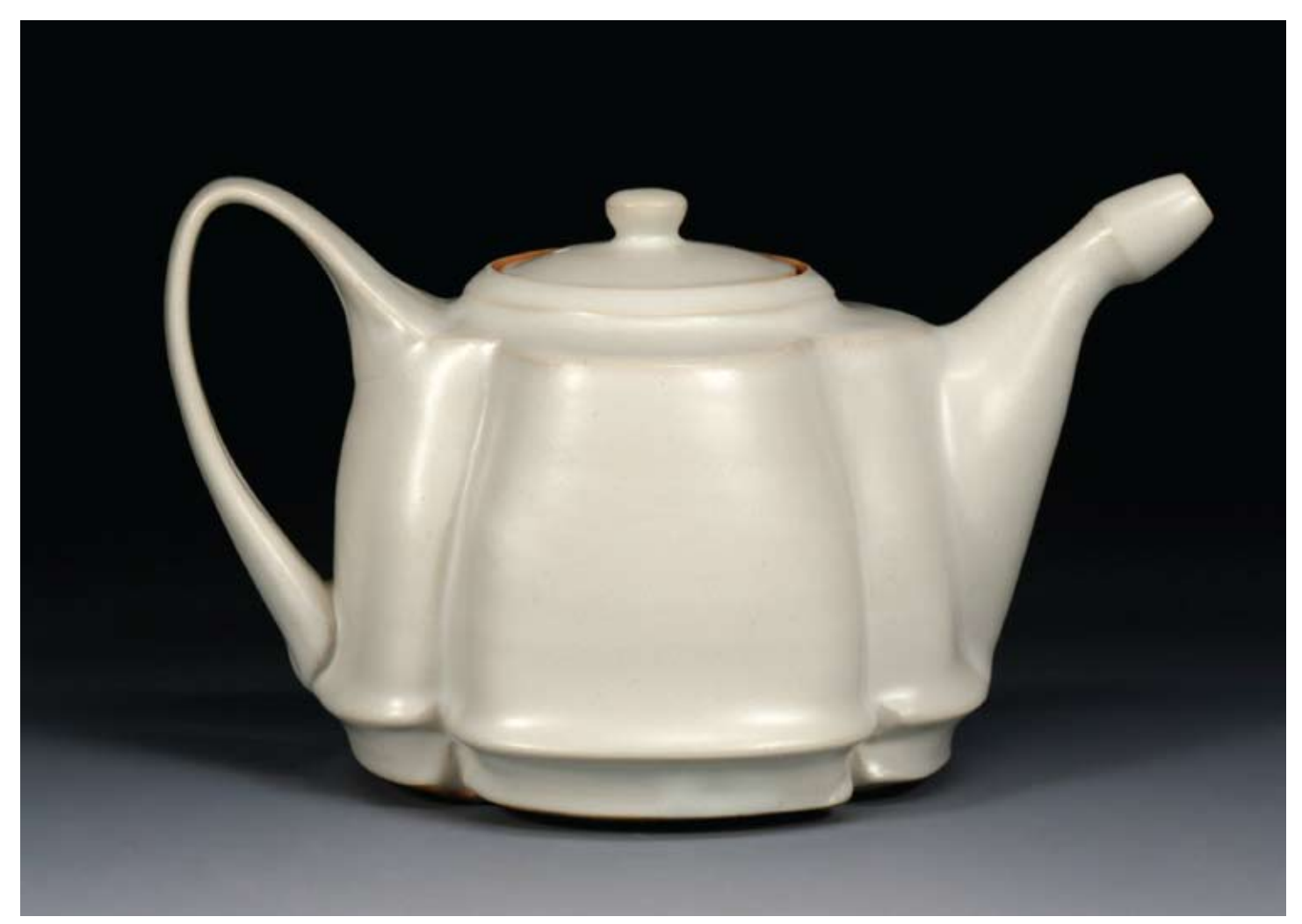
Lobed teapot, 6 in. (15 cm) in height, porcelain, salt fired to cone 10.

I can imagine a teapot that was utility-effective and visually cohesive, yet bored me to tears and I would never ever want to use. The pot must be compelling on some level, either by visual content (in a Modernist sense), emotional-material content (in an Expressionist sense), narrative content (in, well, a narrative sense), and cognitive content (in a Postmodern sense). Work that focuses on one of these categories still benefits greatly from the presence of at least some amount of the others. The visual may be the initial powerhouse, otherwise the viewer may never