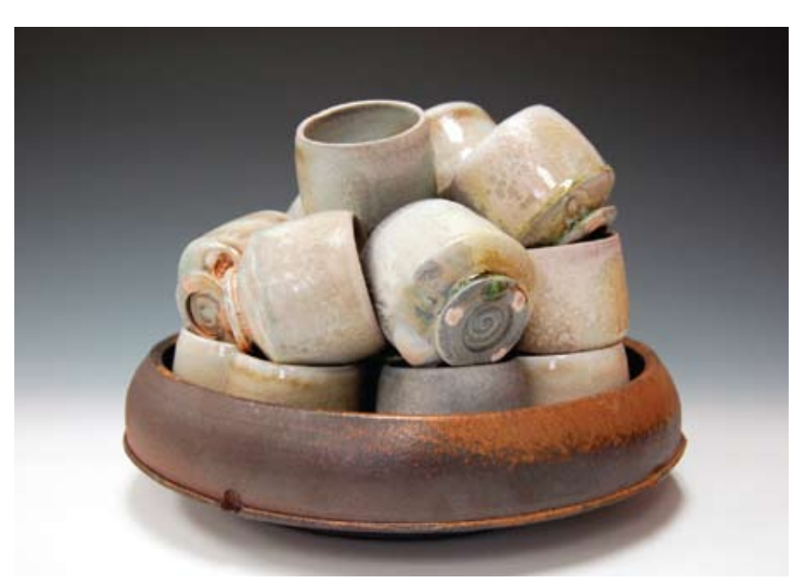
Whiskey Jam (A Pile of Tumblers), 17 in. (43 cm) in diameter, wood-fired stoneware.

The formal aspects relevant to the work are seen in a move toward honesty and simplicity. Honesty is an acceptance of what it means to make pottery—understanding that it is a practice. The form and surface of a piece of pottery simply need to point to the fact that it is pottery. A simple approach can be particularly successful in a culture oversaturated with complex imagery. My approach to form leans toward stark and stoic, highlighting the process of throwing and firing.