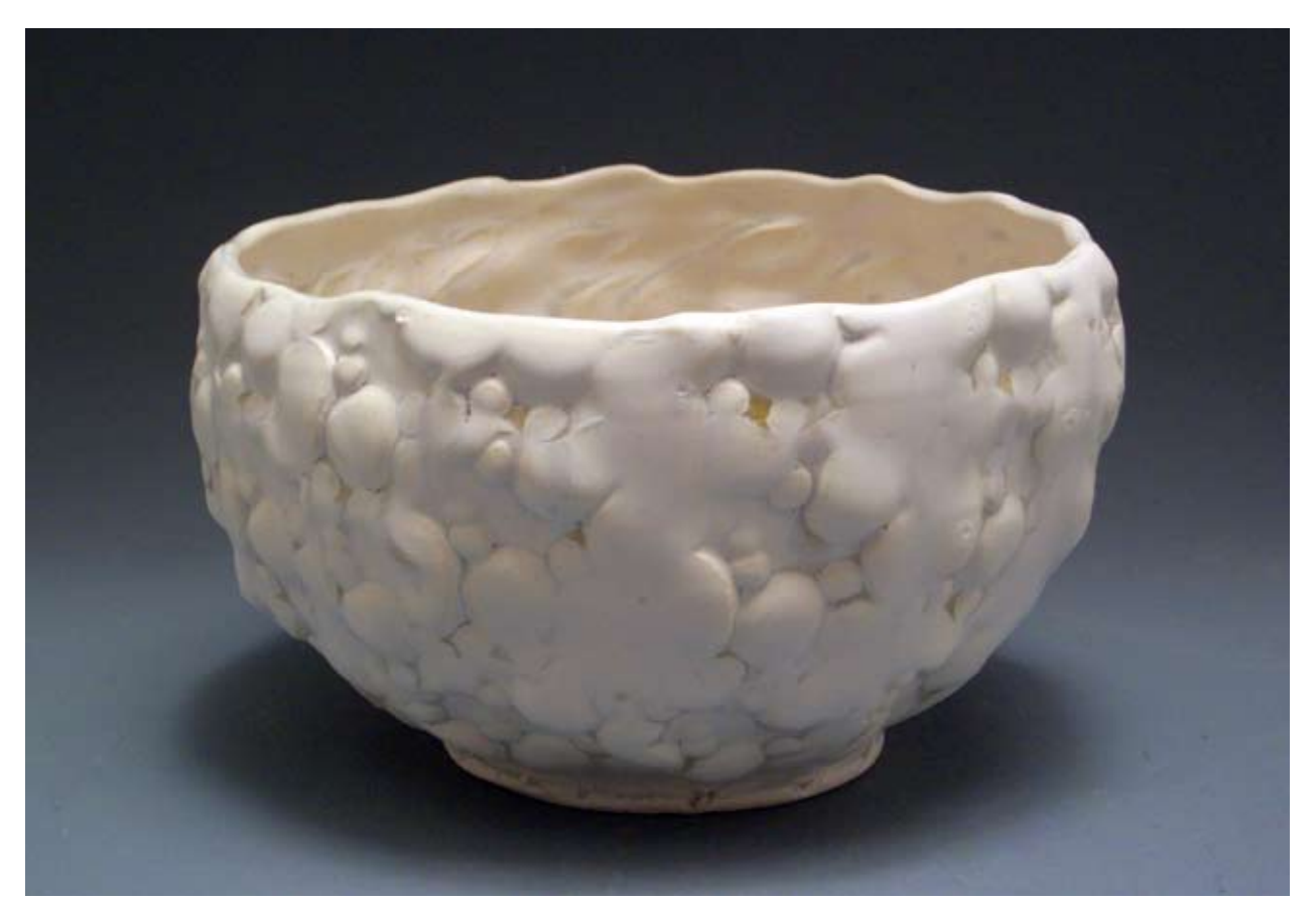
White Glacier Bowl, 7 in. (18 cm) in diameter, porcelain, fired to cone 10 in oxidation.