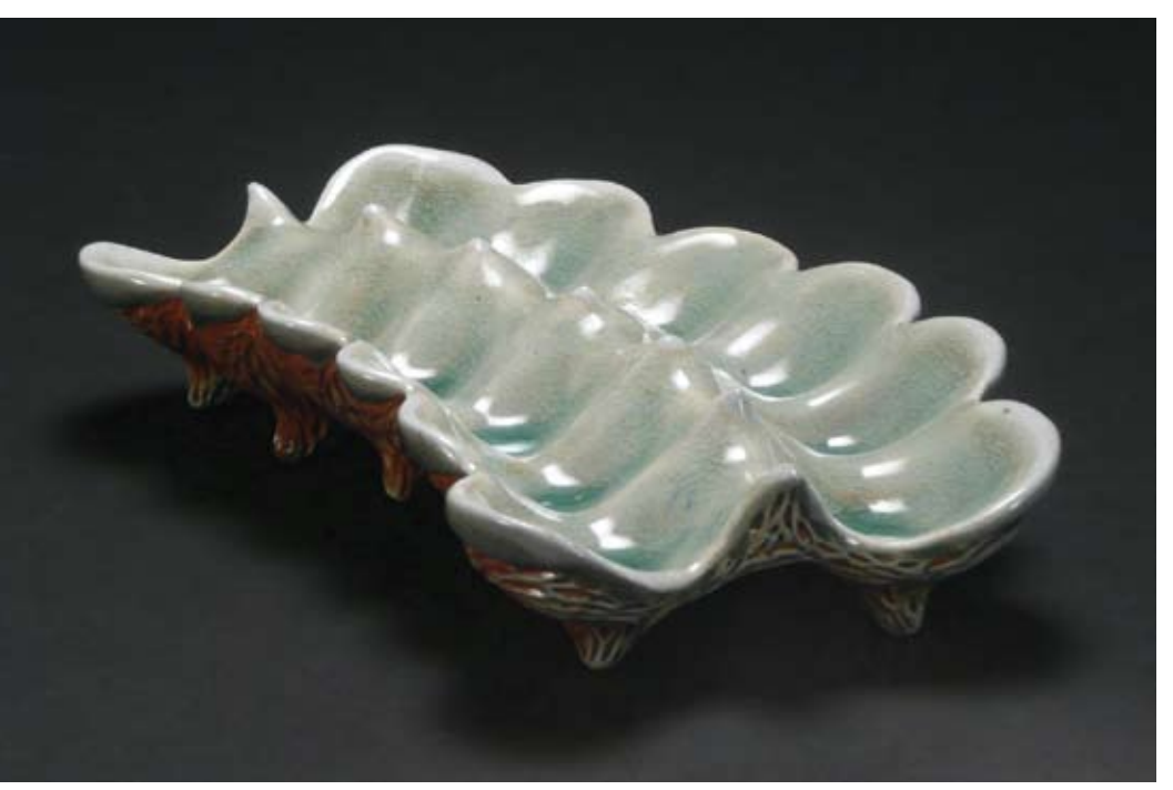
Egg tray, 10 in. (25 cm) in length, stoneware with glaze, soda fired.

As a child, I loved decorating the Christmas tree with my mom. As she unwrapped various globes of glass and silver, and aged yellow lace, she told me stories about my great