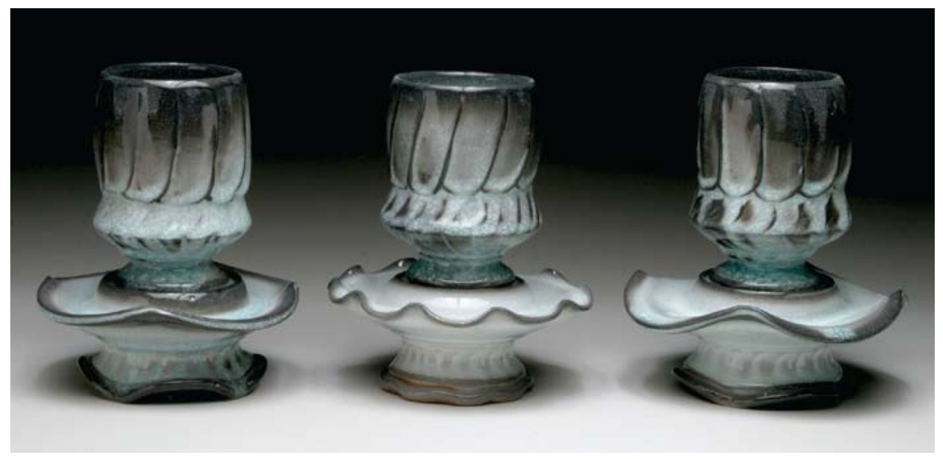
Three cups, 7 in. (18 cm) in height, porcelain, soda fired to cone 10.

Making, beauty, and utilitarianism are all circled around each other. They are all starting points and places to end. If the piece meets these initial criteria, it still has not achieved true success. For me, true success is when someone purchases a piece and brings it home because they had to have it in their lives. When they come back and tell me that the piece has become an integral part of their daily lives or a part of a new tradition or that it's the serving dish