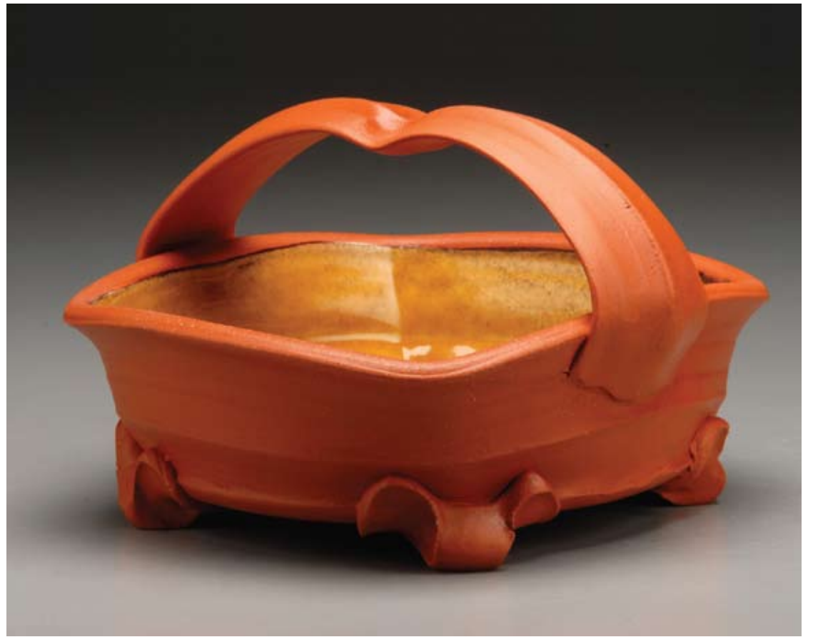
Truffle basket, 8 in. (20 cm) in height, earthenware, fired to cone 04 in an electric kiln.

Marketing is something I feel I could do a much better job at, but here are a few things I do: I make sure the images of the