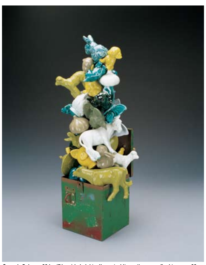
Green is Balance, 28 in. (71 cm) in height, slip-cast white earthenware, fired to cones 06 and 04, with metal ammunition box.