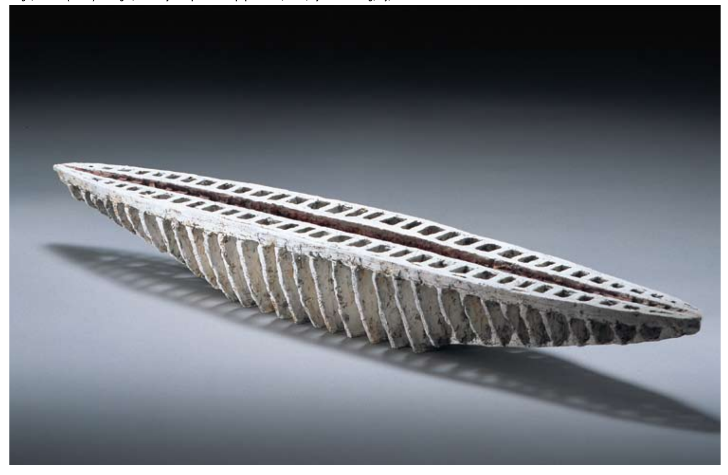
Cargo, 110 cm (43 in.) in length, ball clay with perlite and paper fibers, 2002, by Barbro Åberg, Ry, Denmark.