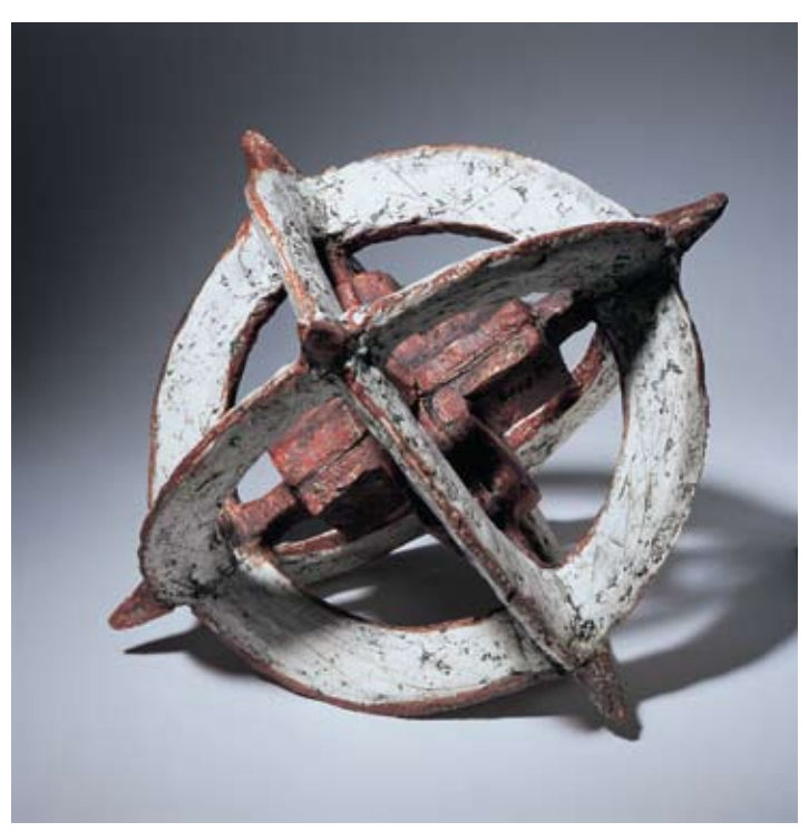
Spheres with Cross, 27 cm (11 in.) in diameter, ball clay with perlite and paper fibers, 2002.

And no doubt, Åberg is extremely conscious of form. Yet her work is never devoid of content. More of a sculptor than a potter, she creates objects of great depth and long lasting impression.