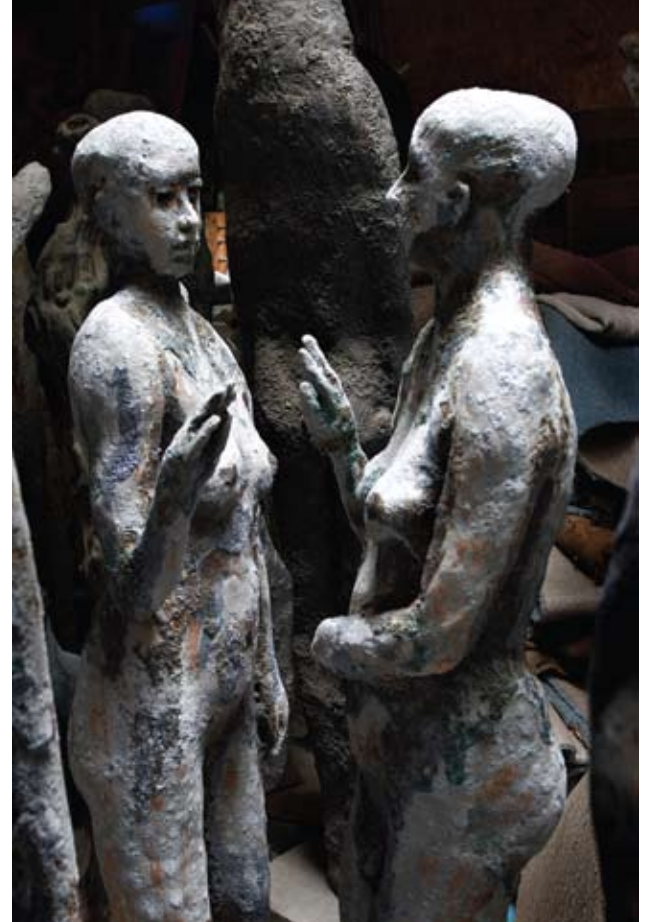
Detail of Peace, handbuilt, crater glaze, fired to cone 6.

I also have a small group of friends that I can bounce ideas off of. We meet once a month for a show and discuss what we are working on. Mostly, inspiration comes down to going into the studio everyday and trying to figure out what I can do that is new but won't be