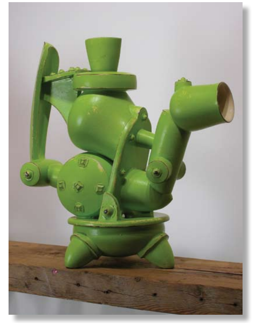
Green Industrial Teapot, 17" (43 cm) in height, stoneware with sign painter's paint.

orking in ceramics was something I discovered in college. Watching my first instructor throwing pottery on the wheel was mesmerizing and something I just had to learn how to