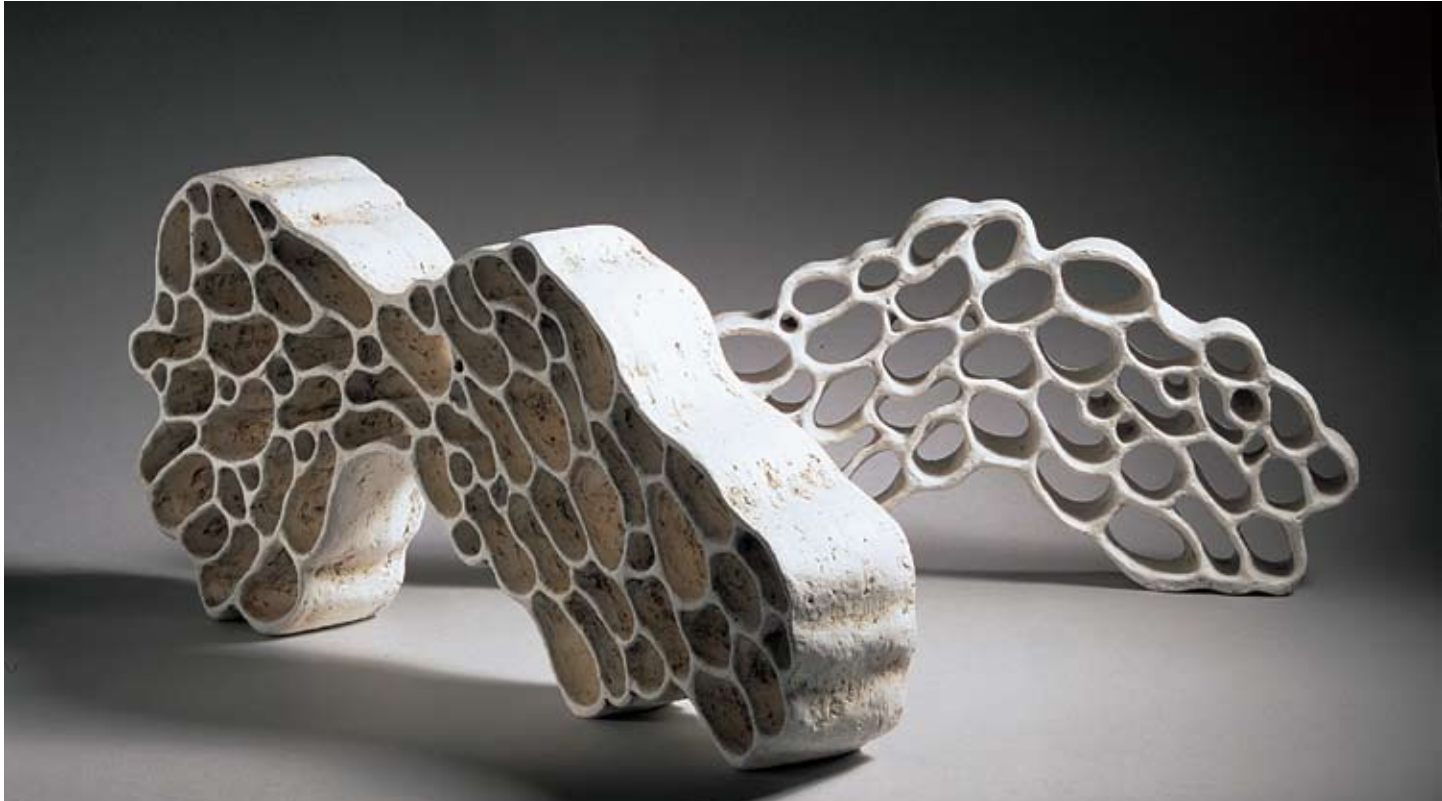
Flow I and Flow II, 65 cm (26 in.) in height, ball clay with perlite and paper fibers, 2003 and 2004.

"I felt a freedom with this new material," Åberg said. "I could do all kinds of things that I couldn't do with ordinary clay. I started working very expressively. I didn't want to control things too much. Perhaps I needed to liberate myself from my time at art school. I started to use bright commercial stains and acrylic paint, I built solid pieces, used cardboard boxes and filled them up with clay, and I