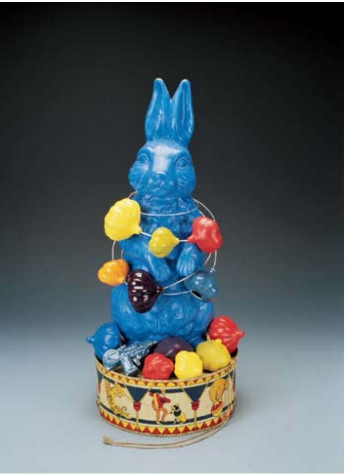
of my studio window is a con- Blue Rabbit with Garlic Necklace, 21 in. (53 cm) in height, slip-cast white earthen-tinuum of movement, sounds ware, fired to cones 06 and 04, with toy drum, wire, 2004.

events, this weight and outcome, and the personal iconography they create." I agree. It would be dishonest for me to produce work that is all about reduction and simplification. Minimalism, Zen and Abstraction are philosophies that I cannot possibly embrace simply because of my weight of recollected events. My life is and was complication, crowding and profusion. When I look around me, that is what I see. From the window of my current studio, which is located in downtown Toronto in a 19th-century distillery building, I watch commuter and cargo trains rattle by. Above the train tracks is an elevated highway, streaming with trucks, cars and motorcycles all day long. A glimpse of Lake Ontario now and then between the boxcars reveals commercial tankers working in the harbor. The world outside tinuum of movement, sounds and vehicles. I find this urban