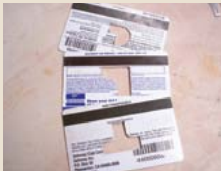
Three credit card dies with distinctly cut shapes in each one.

Securely wrap the sign in plastic and allow it to "rest" on the drywall sheet for two or three days. Afterwards, slide the sign onto a fresh piece of drywall and lightly cover it with plastic. This will help it dry evenly.