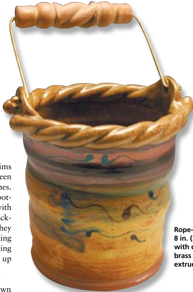
Rope-top bucket, 8 in. (20 cm) in height, with ceramic and brass handle and extruded rim.

P ots with twisted coil rims and handles have been made since ancient times. Lots of beginning pottery students try making pots with twisted coils, but because of cracking during drying and/or firing, they have a high failure rate. Extruding the coils puts an end to cracking problems, as well as speeding up the job considerably.