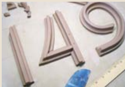
A T-shaped extruder die is used for the numbers, which are assembled on drywall.