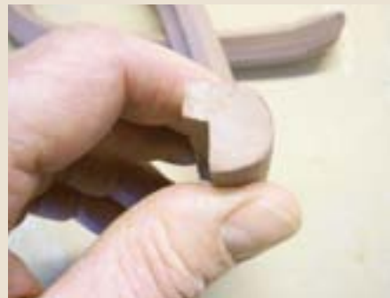
Slab should match the thickness of the notch on the bull nose extrusion.