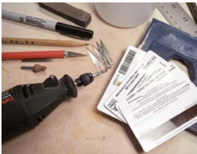
A few simple tools are needed to create dies.

Clean the credit card with soap and water before starting to draw on it.