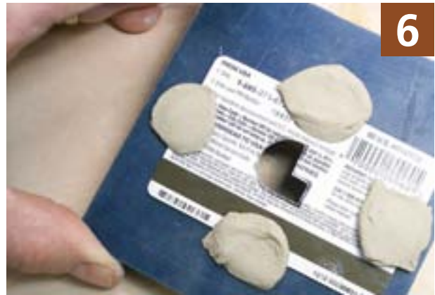
Place the die on an extruder die to check the fit.