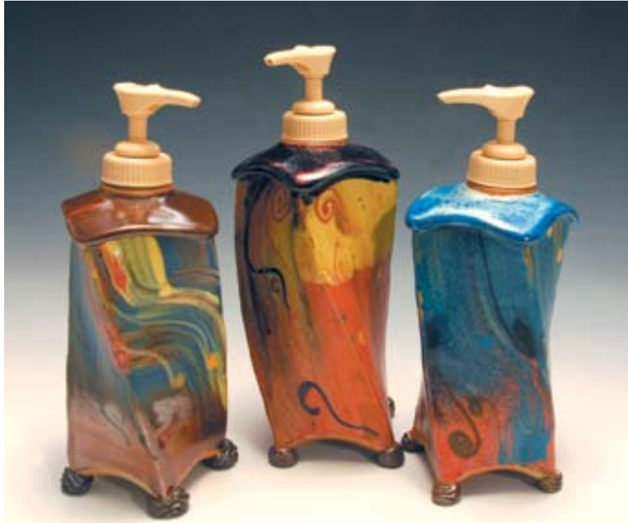
Three finished lotion dispensers, 7 in. (18 cm) in height, handbuilt using extruded parts, with added feet of unglazed dark brown clay and multicolored slip-glazes. Pump dispensers added after glaze firing.

I have been using extruders in my clay work since 1974, after I built my first extruder and made my first dies. I immediately saw the potential for making new forms through extruding, and I've always had an extruder in my studio that I use on a regular basis. Of all the pieces I make, the extruder is used for about two-thirds of them—to produce either the main form itself or an added element for a wheel-thrown vessel. Even my pulled handles start out as extrusions.