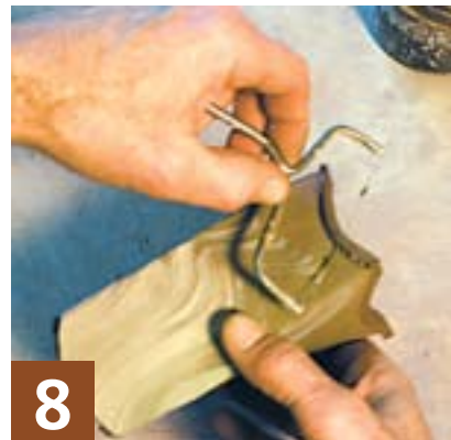
8 Trim the bottom slab flush with the sides.