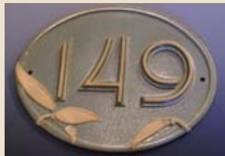
Address sign, 18 inches long, Laguna Speckled Buff clay glazed with Laguna's Fern Mist, fired to cone 5.