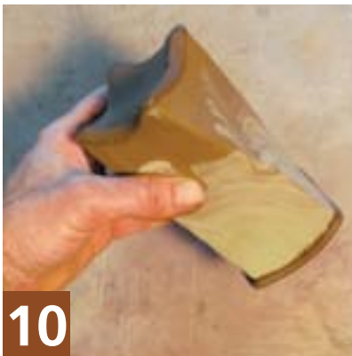
10 Roll the top back and forth to compress the join.