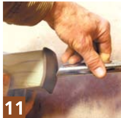
11 Cut a 1-inch hole in the top for the pump.

gives a sense of movement to the finished pot.