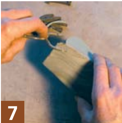
7 Cut arches into the top and bottom of the form.