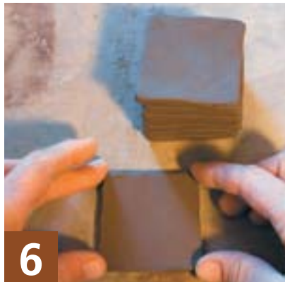
6 Round corners and smooth edges of squares.